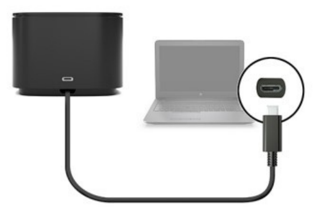
USB Type-C power connector and Thunderbolt Port